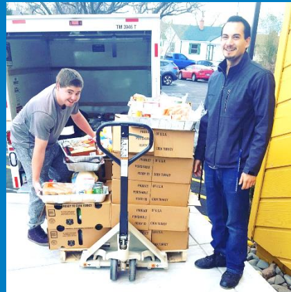
Food Pantry and Donation Collection