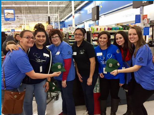
Shopping with the Sheriff