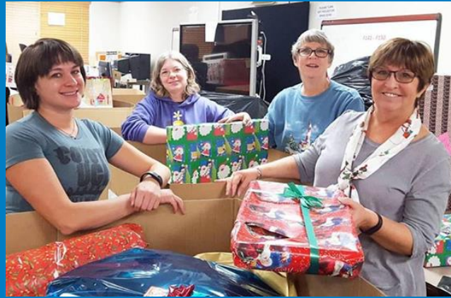
Holiday Adopt-A-Family & Community Toy Table